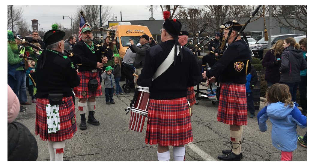
Community spirit is growing in Columbia Township with the addition of new community events, like the St. Patrick's Day celebration in March.

However, there is one ingredient that truly makes us a great place to live—you. I speak from experience when I say that the residents of Columbia Township are the ones that inject life into all our neighborhoods.